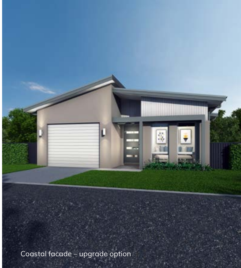
Coastal facade – upgrade option