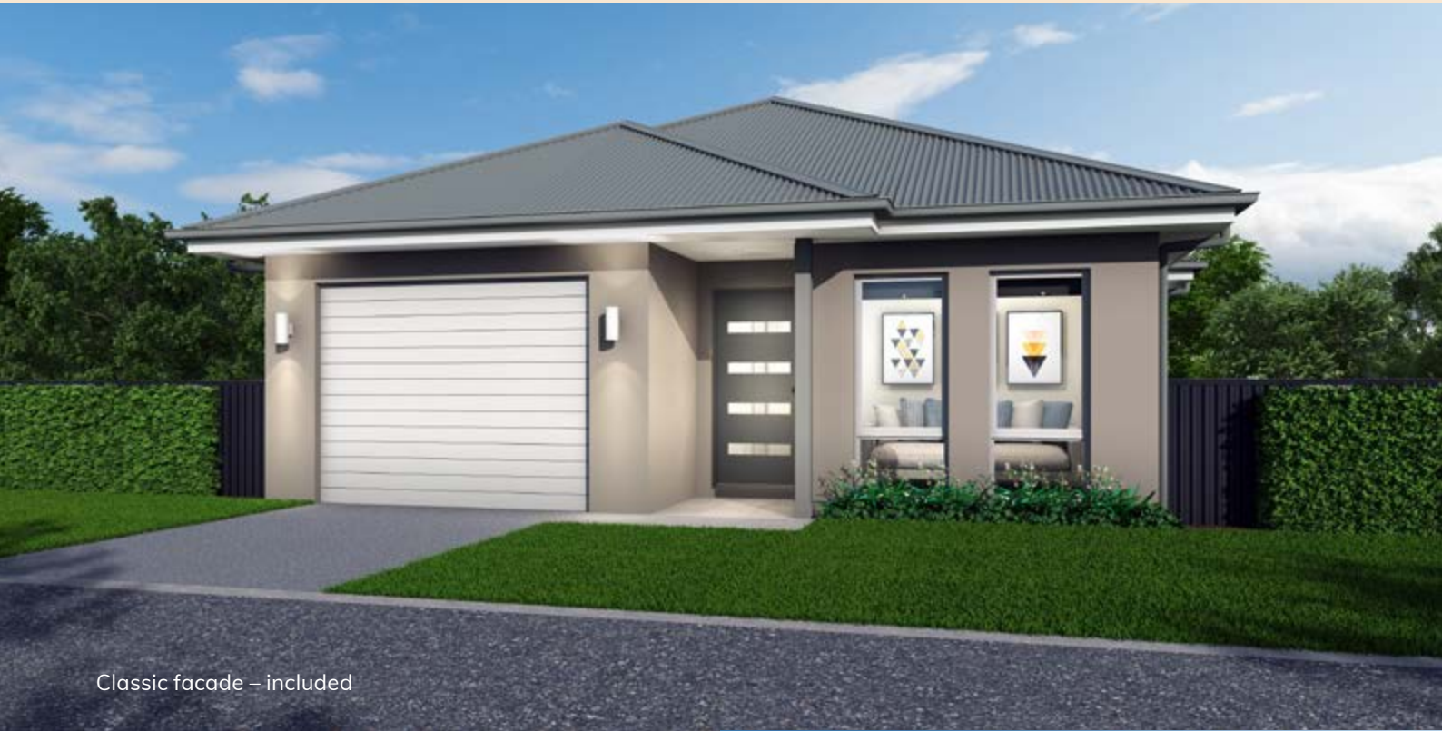
Classic facade – included